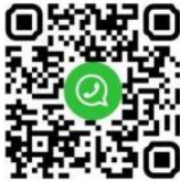
Scan for What'sapp