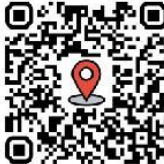
Scan for Location