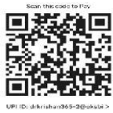
Scan for Payment